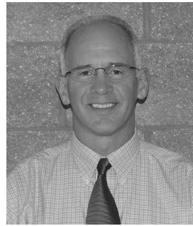
Hopkins Parents and Community

As we approach this new year, the Hopkins School District is facing some of the same emotions that many of our students have when they face kindergarten, middle school or high school for the first time. We feel excitement about the new things we are facing, we feel nervous about how much we have to do and we feel fear for the unknown.