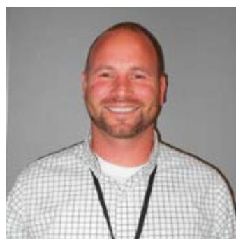
Mack Scudder Middle School 8th Grade Social Studies/History Teacher