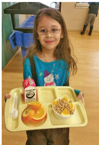
Sycamore Elementary Student enjoying an Orange Crush, Yogurt Parfait & Fresh Orange Wedges

We cannot wait for the shows on February 25th.