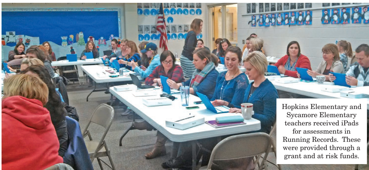
Hopkins Elementary and Sycamore Elementary teachers received iPads for assessments in Running Records. These were provided through a grant and at risk funds.