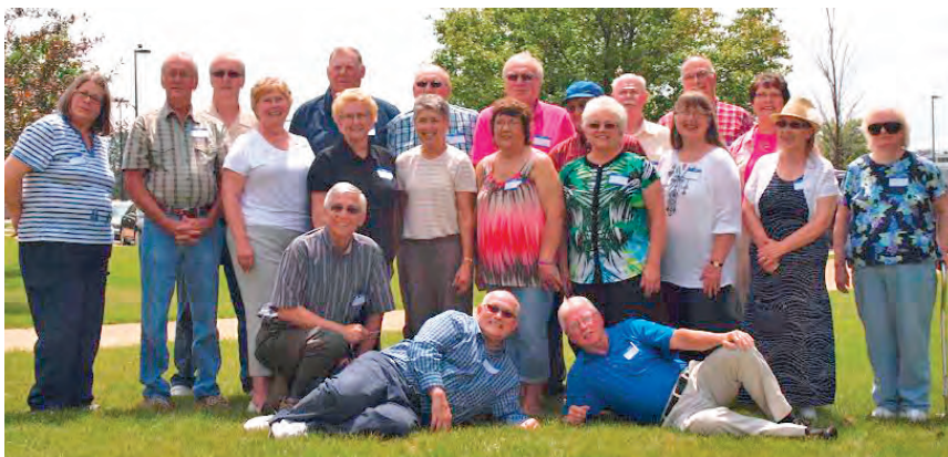
Class of 1965