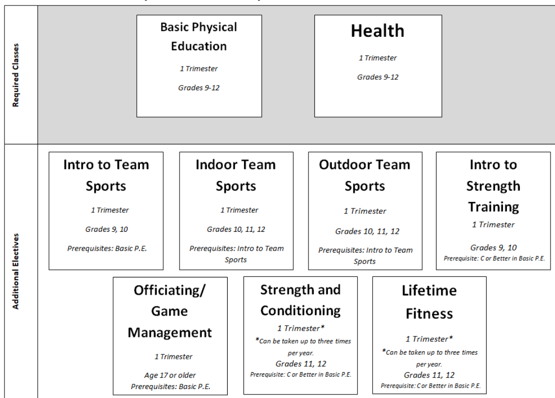
Physical Education Department Flow Chart of Classes

BASIC P.E. (Graduation Requirement- Students may take any year but must take before graduation.)