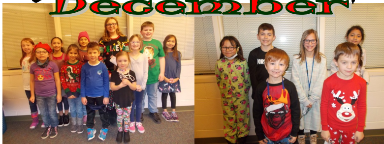
LEFT SIDE PICTURE: