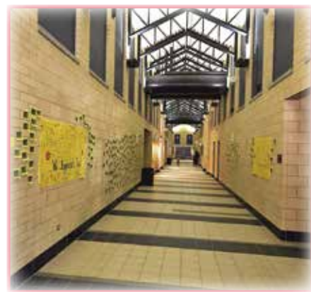
Thank you notes to all HPS staff members line the hallway outside the gym

On Friday, February 3rd, the varsity girls basketball program hosted a teacher appreciation game to recognize HPS staff for their hard work and dedication. All HPS teachers and staff received free admission to the game and a special treat at the door. Varsity players selected individual teachers to recognize at half time of the boys game with a gift and a small appreciation letter. The hallway was decorated with appreciation notes from middle and high school students to teachers, as well as banners for the elementary staff from their students.