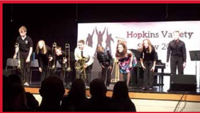
The 7th Grade Band Group takes a bow after their performance