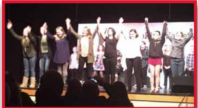
The 2017 Variety Show Cast takes a final bow to close the show